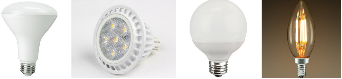
Figure 3: LED reflector, MR, globe, and candelabra bulbs.

In part due to later restrictions placed by Congress, DOE did not meet the statute's timetable, and the backstop has been triggered. However, as required by Congress, DOE did complete rules to define the scope of bulb types covered by the backstop standard.