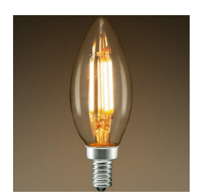
Figure 3: LED reflector, MR, globe, and candelabra bulbs.

In part due to later restrictions placed by Congress, DOE did not meet the statute's timetable, and the backstop has been triggered. However, as required by Congress, DOE did complete rules to define the scope of bulb types covered by the backstop standard.